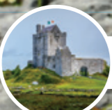
24. Dunguaire Castle