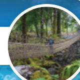
28. Kells Bay Gardens