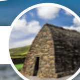
29. Gallarus Oratory