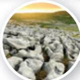
15. Cliffs of Moher Visitor Experience