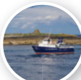
13. Doolin2Aran Ferries