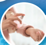
23. Burren Perfumery