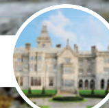
04. Adare Castle & Golf Club