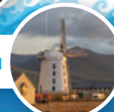
15. Blennerville Windmill