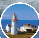
06. Loop Head Lighthouse