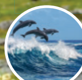
02. Dolphin Watching on the Shannon