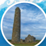
27. Scattery Island