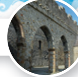
10. Ardferd Cathedral