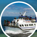
14. Doolin Ferry Company