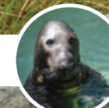
16. Dingle Wildlife & Seal Sanctuary