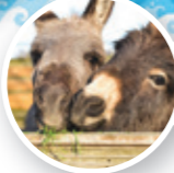
12. Moher Hill Open Farm