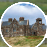
07. Doonbeg Golf & Country Club