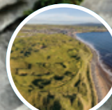
10. Lahinch Golf Club