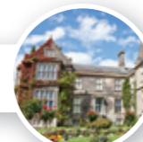
24. Muckross House Gardens