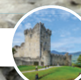
23. Ross Castle